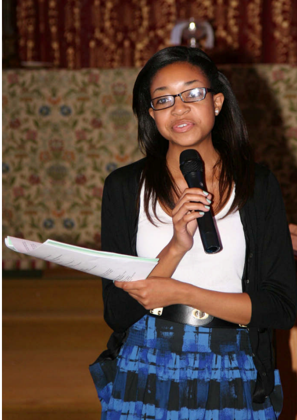
Today was a good day for the Fashion Business!!!