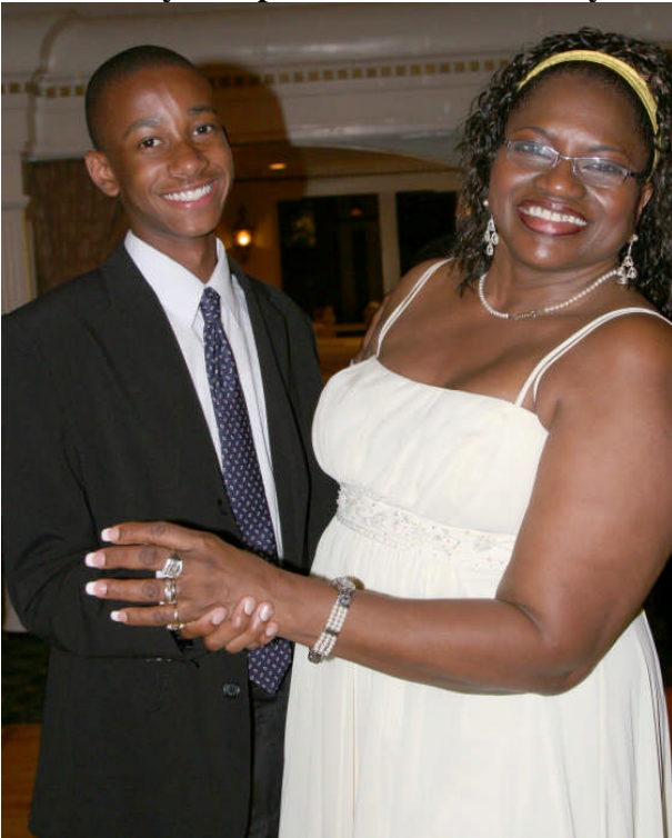
What a Party Animal!