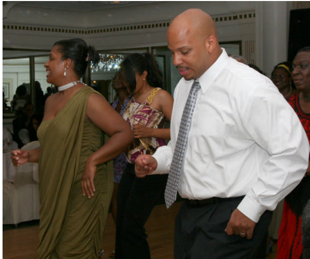
Is there a Chiropractor in the house?