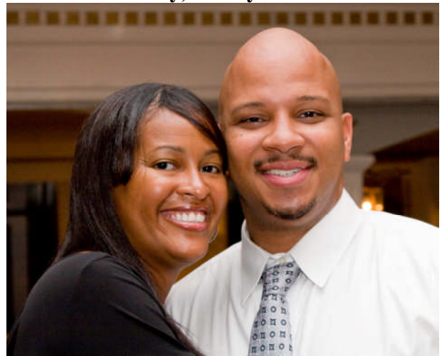
♥ Love is in the Air ♥