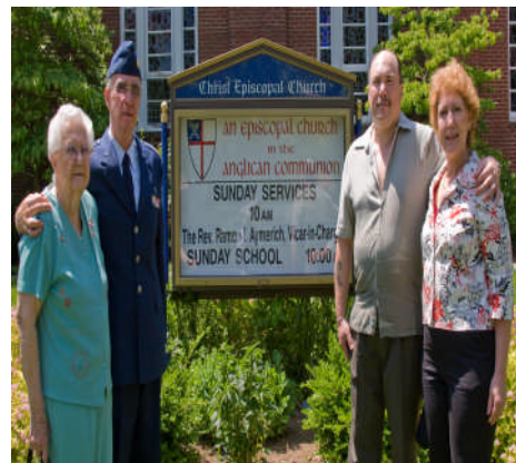
Proud of my military service and worn in memory and honor of the Men and Women from Christ Church who have served in the Armed Forces.