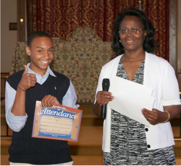
We Are Proud of you 2!!!