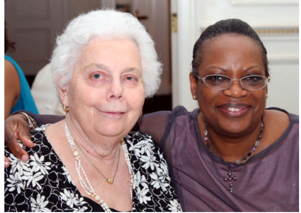
♥ Ebony and Ivory go together in perfect harmony, side by side... ♥