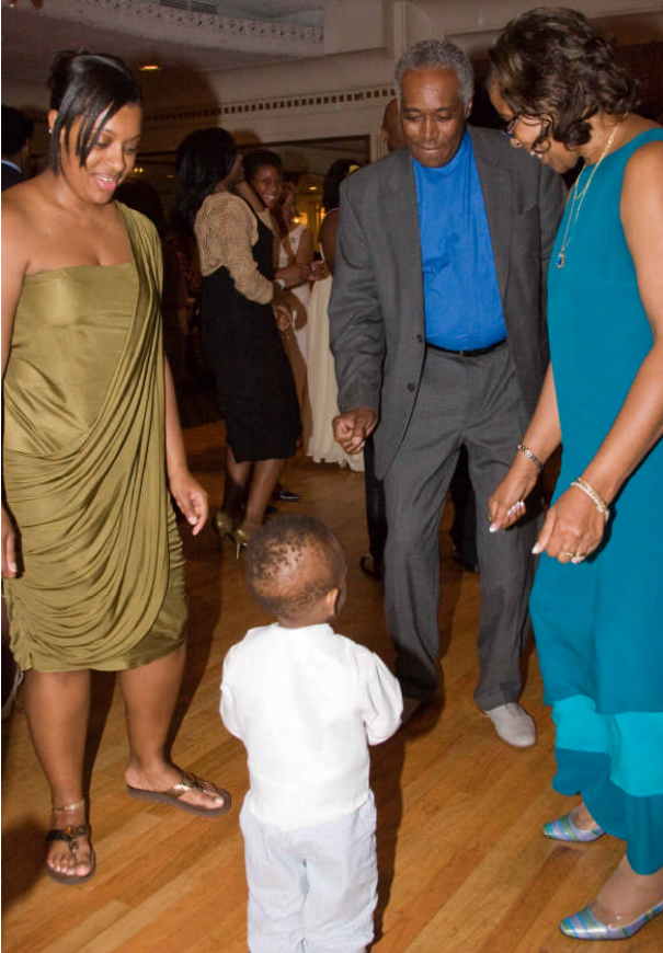
“What do you expect? I am not even 2 yet?”