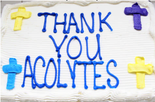
Save me a corner!!!